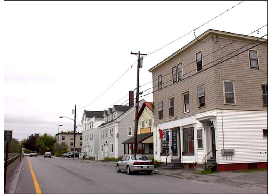
Above: These wood frame structures on Mill Street are representative of the character of the neighborhood during the mid-nineteenth century.

The Cabot Mill (now called Fort Andross) anchors the north end of Brunswick and signifies the importance of the town's industrial heritage. While this neighborhood's architectural history has been greatly altered, the remaining buildings, both the mill and modest tenement buildings, reflect a significant aspect of Brunswick's 19 th century heritage.