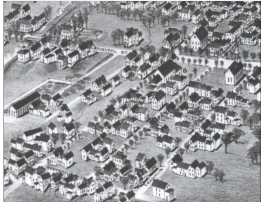
Above: This 1887 map of Brunswick provides excellent views of buildings in the Franklin-Maple Street neighborhood towards the end of the 19 th century.

While most of the neighborhood was developed by the late 1800s, there are several early 20 th century houses in the area. These include cape forms designed to replicate early Colonial architecture, and others reflect the newer building forms, such as the four square. Most of the 20 th century buildings exist along Jordan Avenue and to the south. The buildings of the Franklin-Maple Street Neighborhood reflect the consistent popularity of this small residential area beginning in the early 19 th century and continuing through the 20 th century.